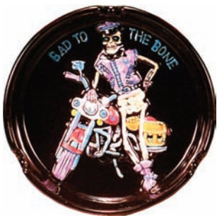
2865 Bad to the Bone 5" x 1-3/8"