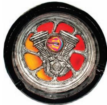
3026 V-Twin Wheel Ash Tray