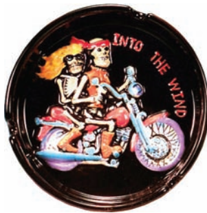
2866 Into the Wind Ash tray