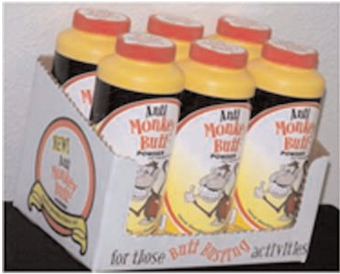
006 6 Piece Countertop Display

Anti Monkey Butt Powder is specially formulated to absorb excess sweat and reduce frictional skin irritation. Ideal for butt busting activities such as motorcycling, truck driving, bicycling, horse back riding and extreme sports. May also be applied inside footwear, under sports pads, and other areas prone to chafing. Indoors or outdoors, work or play, or on occasions when you sit on your butt all day, don't let your buns get red, use Anti Monkey Butt Powder instead!