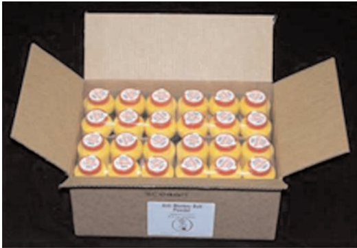
0024 24 Piece case