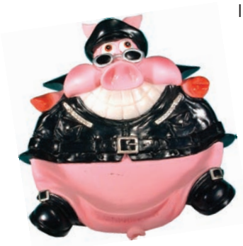
3028 Biker Pig