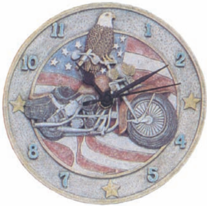
8725 Hand-Painted Cold Cast Resin 7 1/4" Diameter