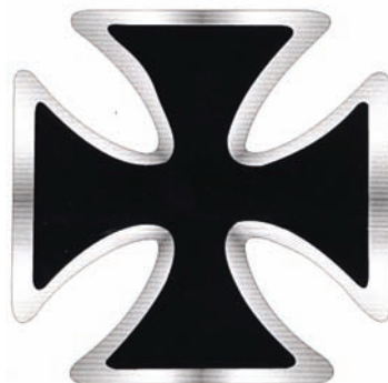
CCO-19 3 1/2" x 3 1/2" Packs of 6