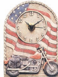
5500 5 1/2" Tall