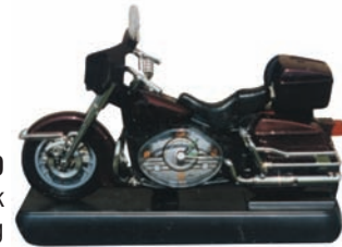
90869 Dresser Motorcycle Alarm Clock Alarm is Engine Accelerating